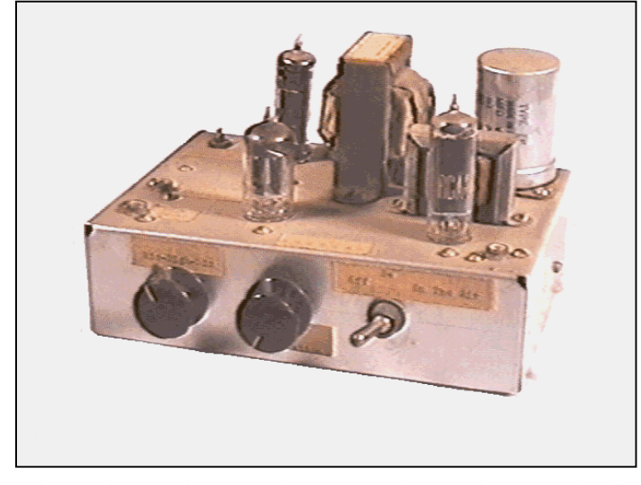
The Knight Wireless Broadcaster rebuilt around 1957 and still operational today.

wanted to get rid of the thing. A couple of bucks and it was mine, but it was in desperate need of repair.